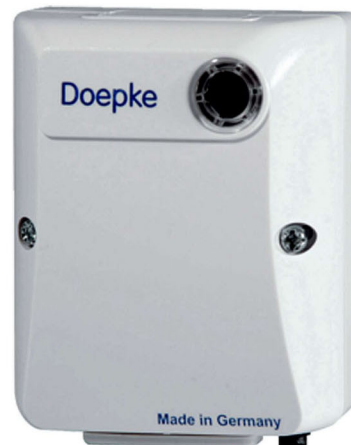
Twilight switch (Dasy)